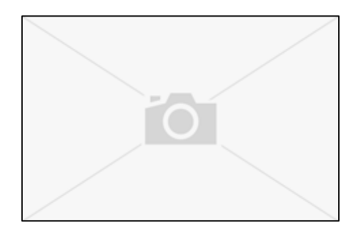
Figure X Title of image or [Description of image]