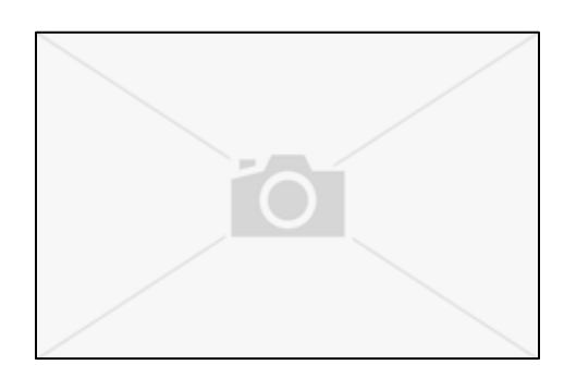
Figure X Title of image or [Description of image]